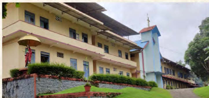
St. John's Seminary Changanacherry 1962-2022