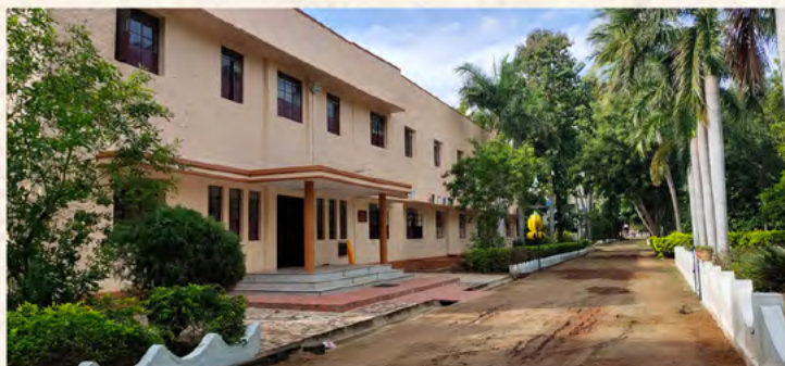
St. Charles' Seminary Trichy 1961-2021