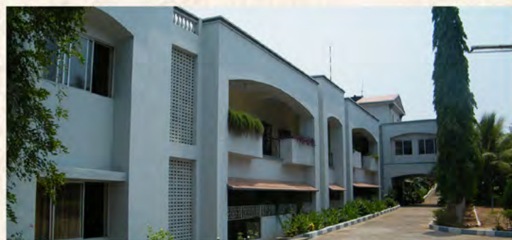
Divine Word Centre Chennai 1997-2022