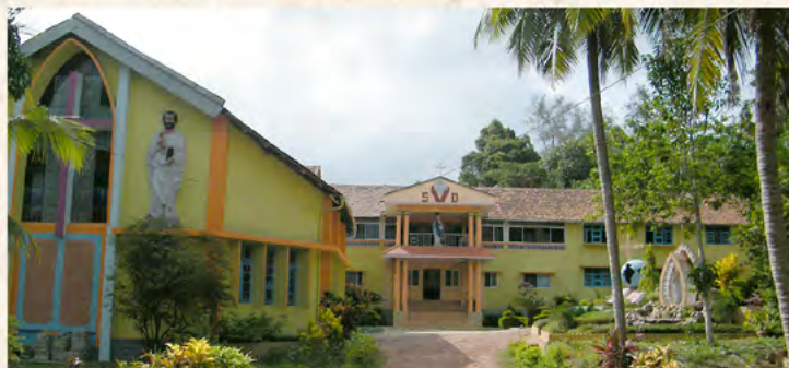
St. Peter's Apostolic School Kirem 1960-2020