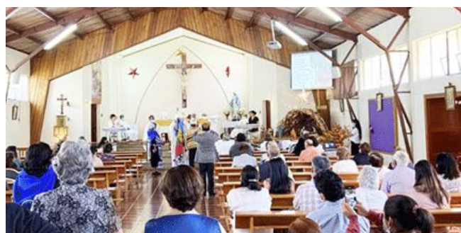
Centennial Celebration of the Parish of Quepe.