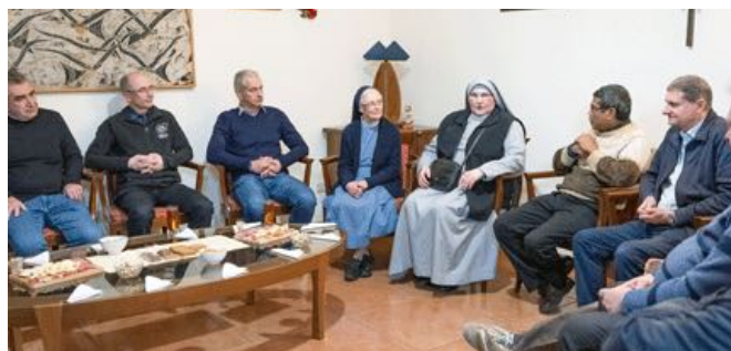
Mother Magdalena with confreres.

According to sources (hopefully reliable), the last visit of a Mother General of the SSpSAP to Collegio del Verbo Divino was the occasion of the Family