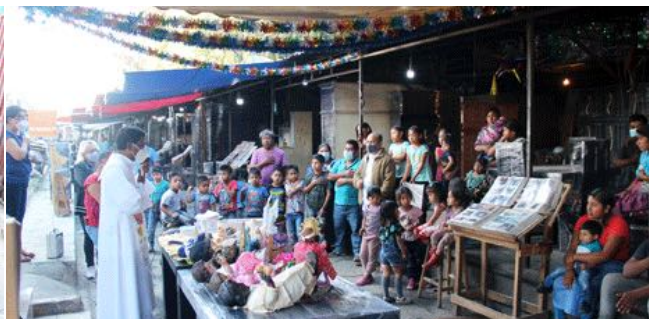
On December 24, a Eucharist was celebrated with the indigenous group.

Since 2020, the JPIC Team of MEX has provided scholarly attention to the children to favor their personal and social development. As a result, the children advance in achieving the competencies of each educational stage. Unfortunately, however, the project could not continue due to the adverse consequences of the