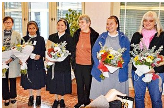
The new Congregational leadership team.