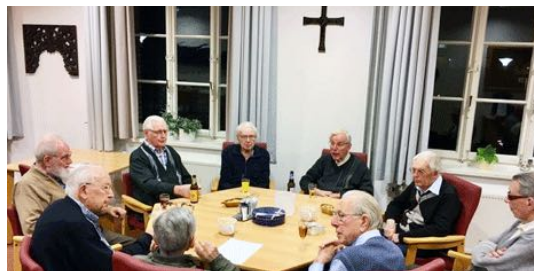
The community in Teteringen.

At each new general visitation, I always have the impression that this is the most challenging reality I have ever encountered. During my days in the Netherlands-Belgium, it was no different. But from that time, it is worth noting that this is a province with a chapter in its recent history very well known in the SVD. They had decided to prepare themselves to reach the end with dignity. But, with the Roscommon consensus, celebrated by the European zone in 1990, with the same dignity and decision, the province opened itself to receive new missionaries.