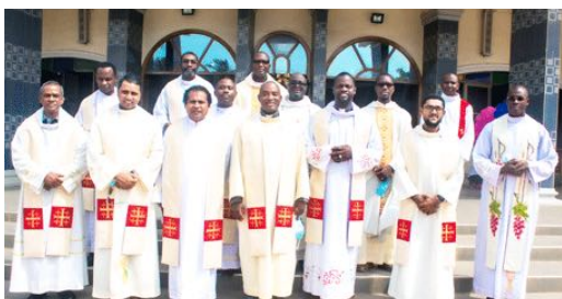
Our confreres joining the SVD Week.