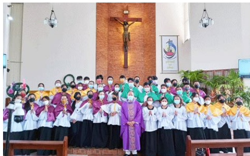
The solemn and joyous installation of the altar servers.