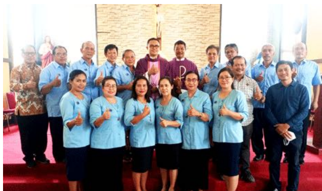
Lay partner group in Meliau Parish.