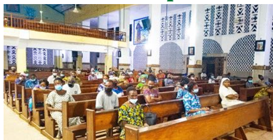
Participants from parish communities.

For the past four years, the Togo-Benin Province has been organizing a whole week of activities to celebrate Saint Arnold Janssen and the missionary work in Togo-Benin and the rest of the world. Entitled "The SVD's Week," this yearly event in all the parish communities of the province took place from January 9-15, 2022. The event involved the participation of all the coordinators of the SVD characteristic dimensions. It became an opportunity for vocation promotion, mission animation, bible sharing, and awareness on the various issues related to JPIC, among others.