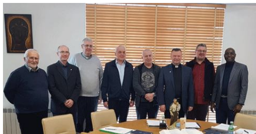
The visitors with the provincial council.