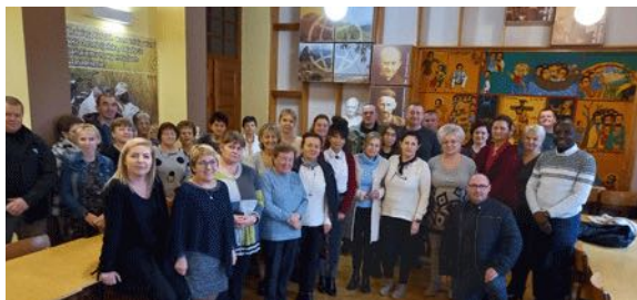
SVDs and lay workers in Pieniezno.

The visitation took place from November 9 to 30, 2021. There were 204 confreres in perpetual vows and 2 in temporary vows (1 scholastic and one brother). The average age was about 58. At present, there are no postulants nor novices in the province. The province includes the Mission Seminary in Pieniężno, 13 mission houses, 13 parishes, two districts (Zakopane and Ukraine), and two missions (Latvia and Norway).