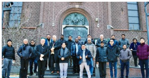
The members of NEB province.