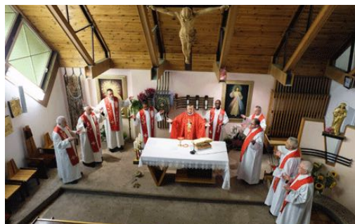
SVDs celebrating mass at the chapel of Mission House.