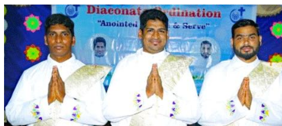
The newly ordained deacons.