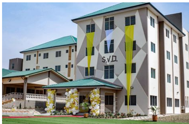
The newly blessed Arnold Janssen Spirituality Center.