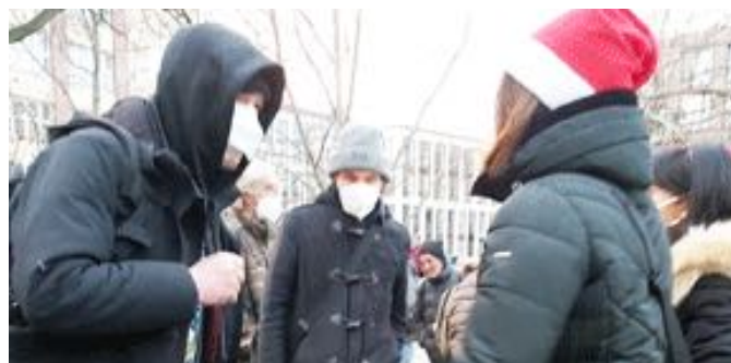
Recipients of this gesture of charity.

Before Christmas, the Christian Community of Indonesia in Prague, in cooperation with the Embassy of Indonesia, carried out a Christmas outreach program in some places in the Czech Republic. On December 12, 2021, the Indonesian community extended help to the homeless people in Prague. They distributed food and handed winter clothes. They also shared to the homeless bible verses written in cards.