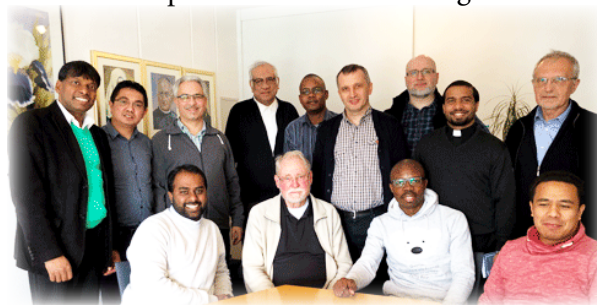
District of Munich during the General Visitation 2020

A confrere, speaking about the current situation in Europe, pointed out that the phenomenon of the