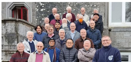
Participants of the provincial assembly.