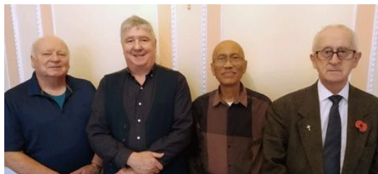
SVD community in England with the Provincial.

The Irish and British Province Visitation took place on November 8-30, 2021. The Visitation showed me that there are many good reasons to continue and strengthen the SVD presence in England and Ireland, especially among the migrants, the poor, the unbelievers, the faith-seekers, and the lay partners.