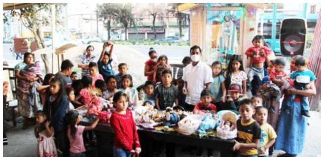
The Purhépecha artisans are indigenous people from Michoacán, Mexico.

The Purhépecha artisans are indigenous people from the northwestern region of Michoacán, Mexico. They are mainly located in the area of Cherán and Pátzcuaro. They have migrated to Mexico City in search of better economic, educational, labor, and health opportunities. However, in their permanence in the city, they have not overcome poverty and social exclusion conditions.