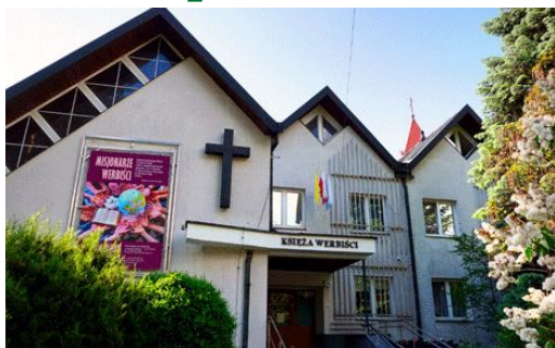
The Mission House in Kleosin.

Komunikaty SVD, the Mission Animation Magazine of POL, traces the presence of the SVD in Kleosin belonging to the Archdiocese of Białystok. The contribution of the SVD ranges from parish work, mission animation, preaching retreats, among others. In addition, involvement in the Family Welfare Association DROGA is essential. In Kleosin, our name is our mission.