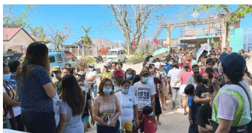
Distributing relief to those affected.

Last December 16, 2021, Typhoon RAI (Odette) hit the southern parts of Mindanao (especially Surigao), then Leyte, Bohol, and the whole south of Cebu Island, including Cebu City. The government has declared a state of emergency for these areas. Our community houses in Cebu and Bohol are partially damaged.