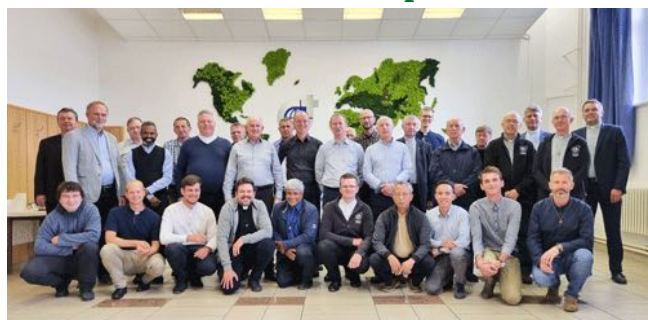
The Provincial Assembly held in Nitra.

From September 20 to 22, the XII Provincial Chapter of Slovakia Province was held in Nitra, in the Mission House of the Mother of God. Its theme was linked to the last General Chapter's invitation to renewal and transformation, taken from apostle Paul's exhortation: "...be renewed in the spirit of your minds" (Eph 4:23). There were 23 members present at the Provincial Chapter discussing the present ministry and the