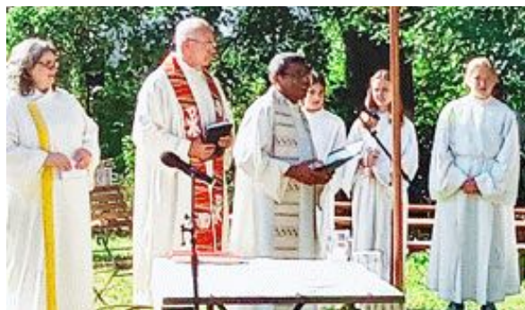
Centennial celebration in Steinhausen.