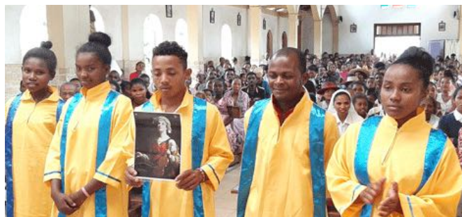
The youth showcasing their talent in a musical concert.

Over seventy youth belonging to the choir groups of the various outstations of Our Lady of the Holy Rosary, Vohilava, in the diocese of Mananjary, had their annual camp meeting from September 8-13, 2021, in the central parish, Vohilava. It was a time for the perfection of voices through voice training, learning new songs, and new techniques regarding the Catholic faith and liturgy. However, the most striking aspect was the eagerness and readiness the youth exhibited in learning and rehearsing.