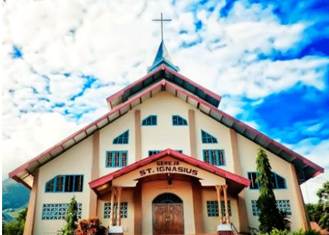
St. Ignatius Parish, Waibalun, turned 104 years old.