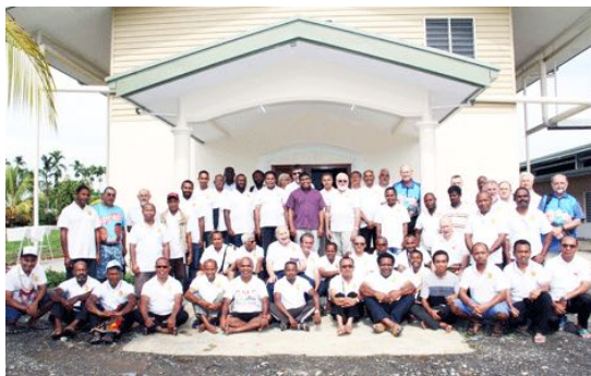
The Superior General with the confreres during the provincial assembly.