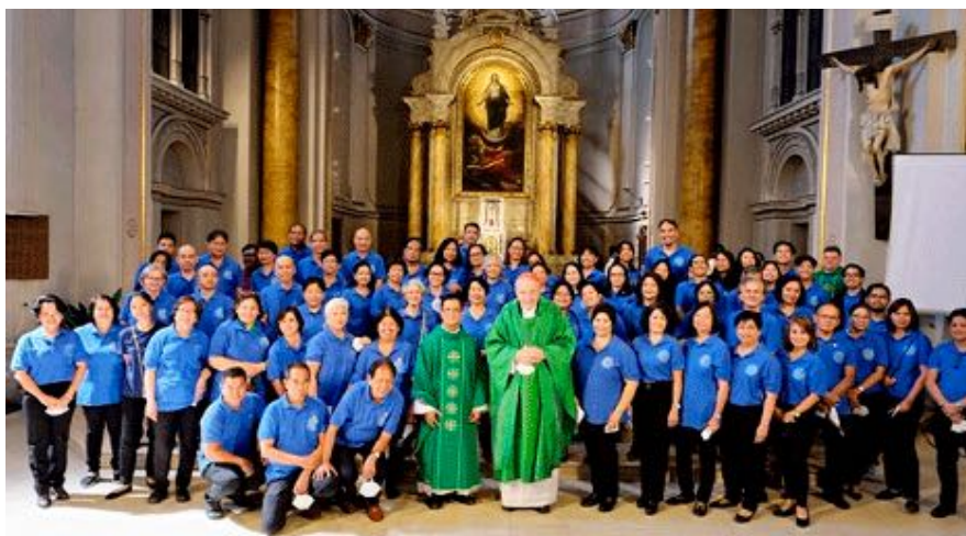
Cardinal Christoph Schönborn with the Filipino community.

With a festive service led by Cardinal Christoph Schönborn, the Philippine Worship Community Vienna-Salzburg celebrated its 20th anniversary on Sunday, September 5. The service took place at the Church of St. John at Keplerplatz in Vienna Favoriten. The parish “Zum Göttlichen Wort” (To the Divine Word), cared for by the Steyler Missionaries, is one of the meeting places of the migrant community of about 1000 faithful.