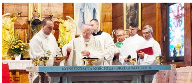
The ceremony has been presided by Marek Jedraszewski, archbishop of Cracow.

On September 4, 2021, took place the consecration of the Anthony of Padua parish church in Brzegi, southern Poland, where SVD missionaries have been serving since 1975. The ceremony has been presided by Marek Jedraszewski, archbishop of Krakow.