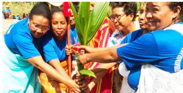
Women in Madagascar planting trees.

The Arnoldus family and the Churches and Mining Network reiterate their commitment to ethical finance that cares for people and Mother Earth in the webinar. In tune with the Time of Creation, religious congregations join together in the Mining Divestment Campaign to promote concrete alternatives from the Church.