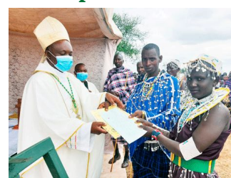
The bishop blessing a couple.

Here in Simanjiro, we celebrate the good aspects of our Maasai culture. We sensitize our people to change those aspects that go against the will of God and the rights of women and children. This is why the theme of our Parish