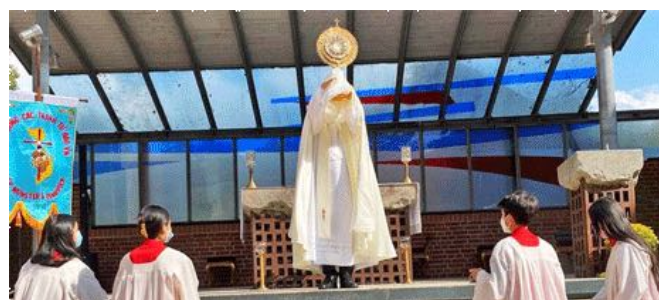
There was a solemn Eucharistic adoration.

All were happy for the opportunity to join the inter-diocesan day of action. In the Eucharistic celebration,