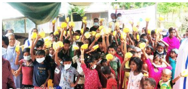
We organized an inter-religious children's meet in the tea garden.

"Baskali tea garden" is about 30 Kilometers from the Immaculate Conception Church in Chittagong, the presbytery where I live. In one of my visits to the tea garden, I was moved by the pitiable conditions of the children there. There are about 250 families in the tea garden, 700 daily wage earners. There are more than 150 children below 12 years of age. The tea garden has an elementary school up to class 5 with two full-time teachers. For one and a half years, the school has been closed due to COVID-19. Only a few students go to the school during the average time, and hardly anyone passes class 5. There is no opportunity for higher education. The main reason is the apathy and lack of interest and awareness among the parents.