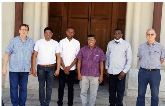
Our confreres in Paris with Fr. Superior General.