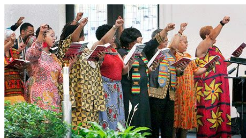
Our Lady of Africa's first Mass animated by the choir.

On July 4, the newly formed Our Lady of Africa parish community on Chicago's South Side celebrated its first Mass. After years of collaboration among Chicago Archdiocesan officials, pastors, and parishioners of Corpus Christi, Holy Angels, St. Ambrose, St. Anselm, and St. Elizabeth, the unified Our Lady of Africa parish was created.