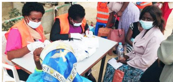
One hundred twenty seven people were medically attended, primarily women.

July 25, 2021, is the day proclaimed by Pope Francis as the Day of grandparents and the elderly. The Divine Word Parish in Viana did not miss this day without giving the well-deserved honor and respect to the grandparents and elderly of the Parish. The Caritas and Health commission organized a special event on July 21, 2021.