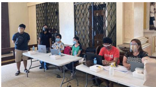
The Sacred Heart Parish and Shrine in a vaccination drive.

The Sacred Heart Parish in Kamuning City has been administered by the Society of the Divine Word ever since, even before its founding as a parish, the Sacred Heart Church on October 3, 1941. It is the first parish to be erected in Quezon City after the city's inception in 1939.