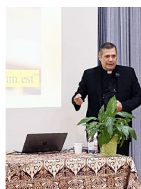
A seminar about Media and Mission.

On October 23, Collegio del Verbo Divino was the host and the organizer of a seminar on the month of the mission. With its theme of Media and Mission, two speakers gave input and reflections based on their work and ministries.