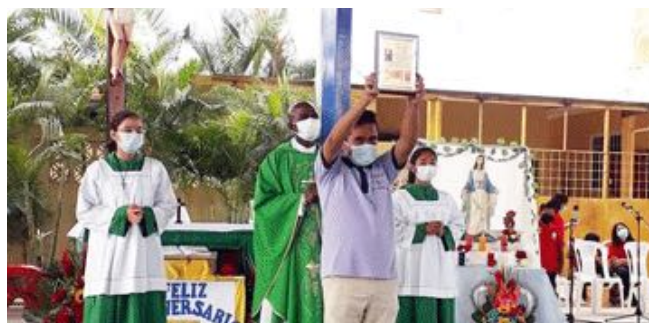
Saint Arnold Janssen parish in Guayaquil.