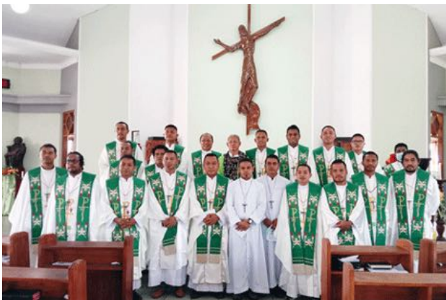
Twenty SVD missionaries received the mission cross.