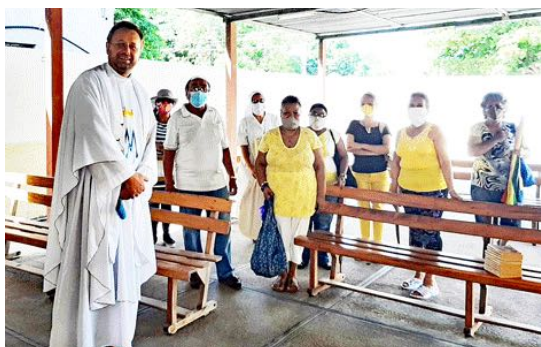
Strength and optimism are provided by the people.