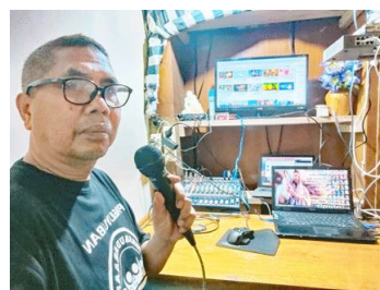
The Gema Soverdia Radio Program.

The COVID-19 pandemic has changed the way we are doing missions in Indonesia. But, unfortunately, at the moment, we cannot organize any activity involving a crowd of people since the virus is still within our path of life. So then, what can we do toward the theme of this World Mission Sunday "we cannot but speak about what we have seen and heard (Acts 4:20)"?