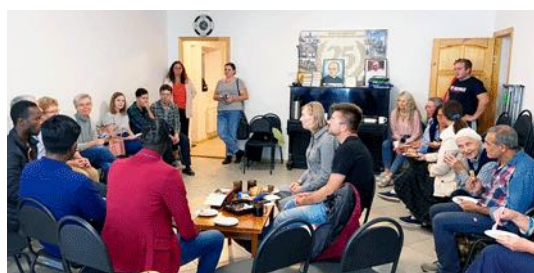
Migrants and international students are welcomed.