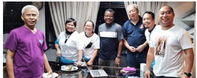
Lay partners and the SVDs.

The celebration of SVD Mission Week in PHS this year started on August 31, 2021, with a novena mass in honor of the Blessed Virgin Mary. The online prayer activities were facilitated by the DYRE, the official radio station of the province.