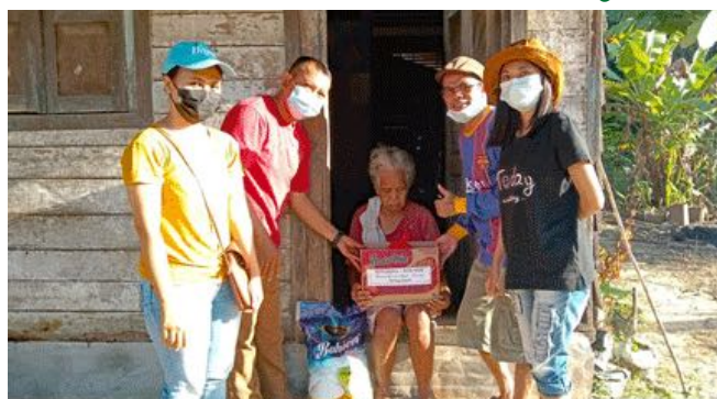
We prioritized to help low-income families, elderly, retired etc.

Last June 2021, Indonesia was severely hit by the new variant Delta of COVID-19. As a result, those infected were rising, and critical cases and deaths were unstoppable. As a result, the country was on a red alert. With the siren of ambulances heard all day long and hospitals full, the situation was alarming for many.