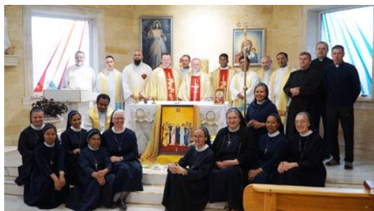
The 30th anniversary of SSPS's presence in Russia.

On the 30th anniversary of SSPS's presence in Russia, our Sisters organized a retreat. All our SVD confreres received an invitation. The theme se-