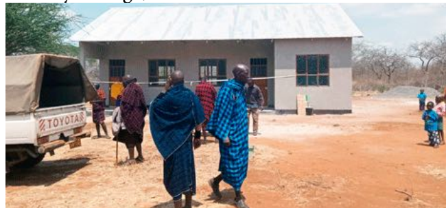
The nursery school ready for the inauguration.

Two years ago, we started a Small Christian Com-