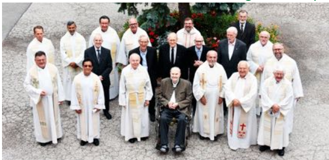
Nineteen jubilarians were present.