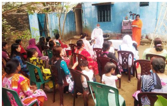
The "Word of God" is the Center of our Parish Community.