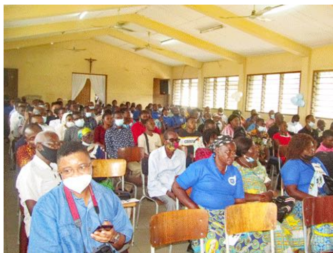
The participants of the lecture.

The day's lecture was mainly about the history and work of the Congregation in RDC for the past 70 years. Present at this event were some confreres of the province, the theologians from the Common Formation Center, Friends of the SVD, and other well-wishers.