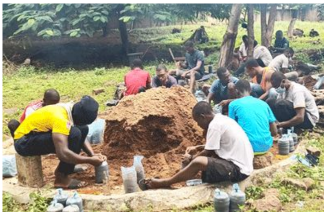
Our postulants preparing the mushroom compost.

With hope and facing the challenge of rigorous preparation, the harvested mushroom will be ready for consumption and sale in several weeks. St. Thomas Aquinas once said, "Without Work, it is Impossible to Have Fun." Our postulants are having the best of their times facing the Mushroom Production challenge.