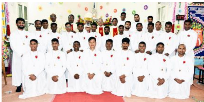
Our twenty-eight newly professed members.

SVD, Bishop of Indore Diocese. In his inspiring homily, he exhorted the newly professed members to "let God be the driver on life journey; trust and rely on His skills either on the smooth road or difficult road, but sure of reaching the safe road."