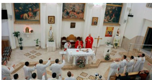
The parishes are lively ecclesial communities.