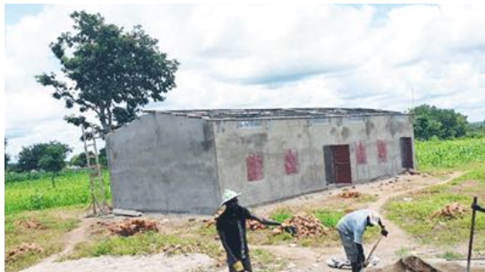
The middle school is on construction.