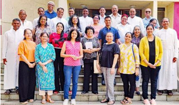
A new Lay partners group.

Heart Church, Santacruz, St. Andrews Church, Bandara, Immaculate Conception Church, Borivali, Good Shepherd Parish, four Bungalows at Andheri West and Malad Church.