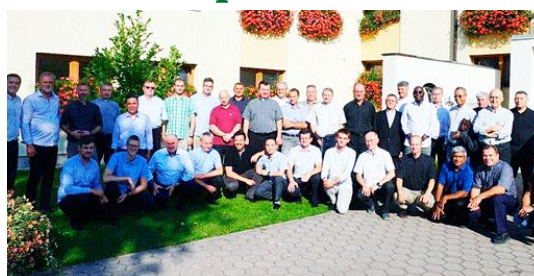
Members of the SVK Province.