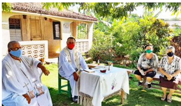
We celebrate Sunday Mass and two Masses a week.