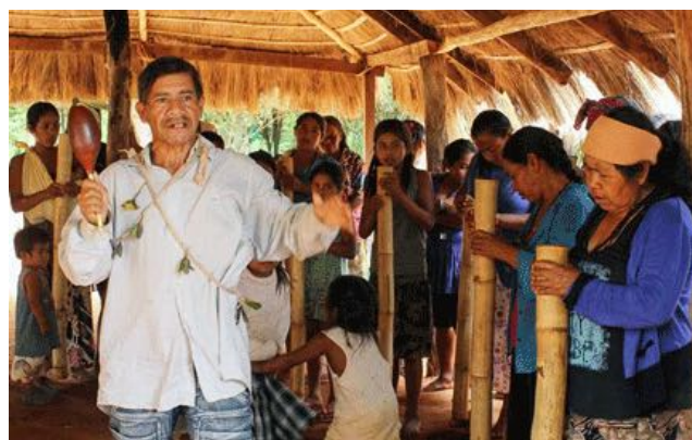
Avá Guaraní communities in Paraguay.

In just two months, six communities of the Ava Guarani were violently evicted from their ancestral lands.