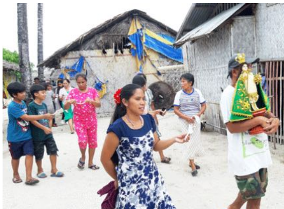
The image of Santo Niño was brought in pilgrimage to the chapels.