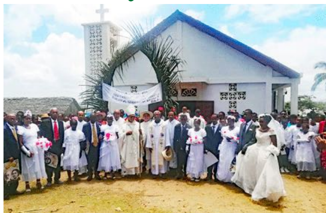
The blessing was linked with the celebration of weddings and first communion.