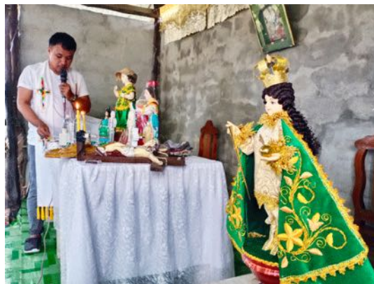
A novena to Santo Niño.