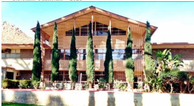
The main building of the Retreat Center.

equipped with newly tiled granite surfaces and stalls.