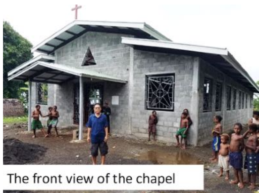
The front view of the chapel