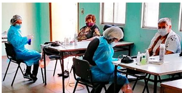
Podiatrists carried out foot interventions.

On January 15, 2021, a group of students from the Centro de Formación Padre Paul Becker (Fr. Paul Becker Training Center) carried out interventions for the Seniors Club of Cerro Navia. Podiatrists carried out the social action with the proper sanitary measures. It was planned and organized within the community service plan that the Training Center for Social Development organizes as part of its mission.