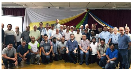
The members of ARE Province.