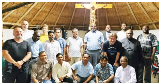
Our confreres in the Region of ZIM.