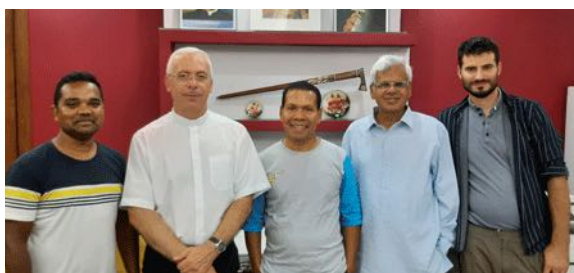
Visiting our confreres working in Vlorë, Albania.

The ITA province consists of Italy and Albania. The province has 38 members; 34 are present, two confreres are yet to arrive, and two are in excommunication. There are 14 nationalities in the province, and the average age is 54 years. Hence, the province has a richness of interculturality. Furthermore, the province has three languages: Italian, German and Albanian. Thus, the province is challenged to send the confreres to different places and ministries.