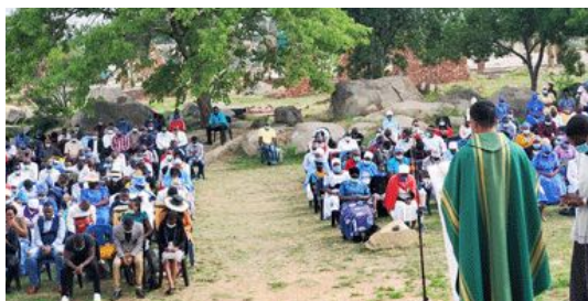
An outdoor mass in Harare.