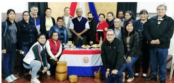
With our lay partners.

The General Visitation of the province of Paraguay last October was an experience not only exciting and educative but also fascinating and heartwarming for me. Therefore, I want to share with the readers of Arnoldus Nota six paradoxical developments that captured my attention during the Visitation. I consider them paradoxical because each issue involves a pair of peculiar and apparent opposites, complementing and producing positive vibes.