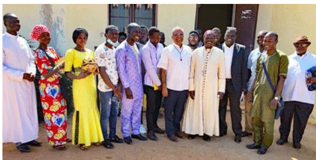
The inauguration of Catholic Chaplaincy program.