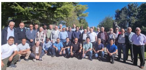
The members of ESP Province.