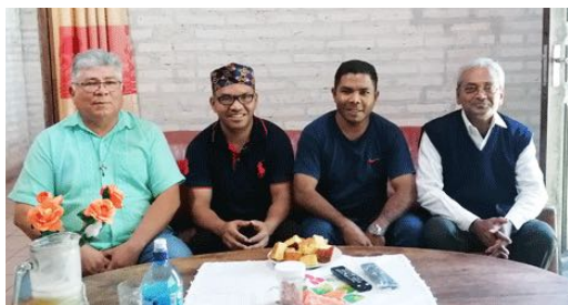
Visiting our confreres.