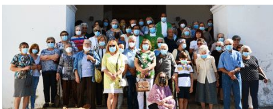
In Almodôvar; with parishioners after Sunday mass.

My visitation in Portugal Province started on September 15 and ended on October 14, 2021. In Portugal, I met with very different realities, like in the Alentejo, with its quiet villages and hamlets, where young people need to leave to study or better conditions. But also with lay people committed to the mission in various places, or even with a church full of children for catechesis.