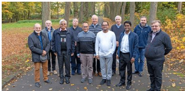
The participants of the meeting of Mission Secretaries.

European Mission Secretaries meeting was held in Sankt Augustin, Germany, from 25 to 30 October 2021. It was initially supposed to be held a year ago, but this was not possible because of the pandemic.