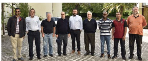
With some confreres of POR Province.