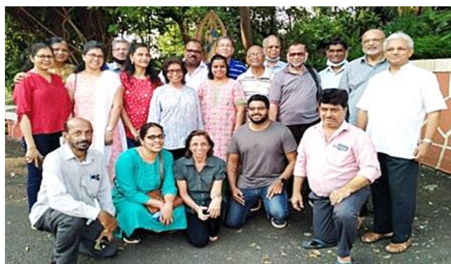
The participants of the Bible seminar.