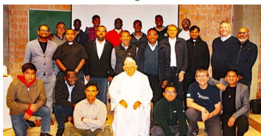
The participants of the Provincial Assembly.