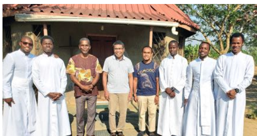
With the novices and their formators in Kabwe.