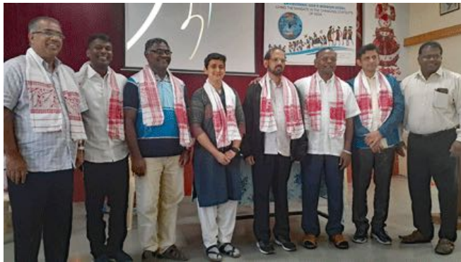
The participants of the fourth MER Conference.

The Fourth National Missionary Education and Research (MER) India Conference was organized at St. Arnold's Seva Sadan, Indore, from November 2, 2021, with the theme Envisioning God's Mission in the 2020s: Living the mandate in the changing contexts of India. It was the fourth time over the past 15 years that SVD confreres came together under the banner of the MER-India Subzone.