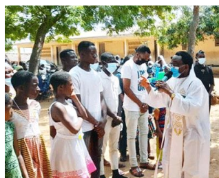
The first mass celebrated in Mafi Dove.

"W e cannot but speak about what we have seen and heard" (Acts 4:20) was the theme of this year's World Mission Sunday. To respond effectively to that, members of the St. Maria Goretti Parish, Battor, embarked on a three-day evangelization and outreach program, which aimed at establishing a Catholic Community in Mafi-Dove in the Volta Region of