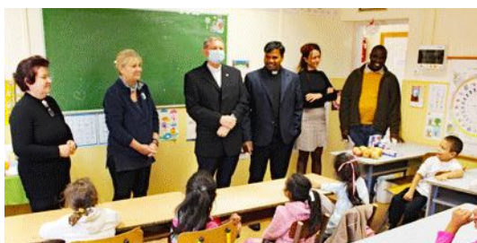
Visiting a Catholic school in Köröm.

The General Visitation of the Hungarian province took place from September 15 until October 2, 2021. Hungary has 9.8 million inhabitants, and Catholics are around 4 million. Serbia has 6.8 million inhabitants with a tiny minority of Catholics - only 5% of the population.