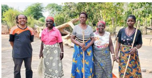
The parishioners and the parish priest in Mwandia.