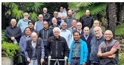
The members of the ITA Province