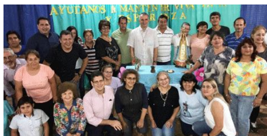
Visiting the community of Maria de Fatima in the suburb of Posadas.

The general visitation to ARE was initially planned for September 2020. However, due to the pandemic, it was postponed to October 2021. Therefore, after receiving permission from the Argentine Embassy in Rome, I finally arrived in Posadas, Misiones, on October 9, 2021.