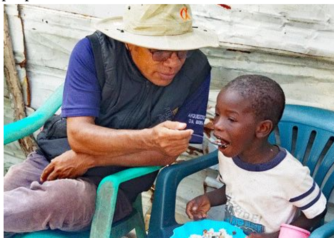
We fed more than 200 vulnerable children.

Pope Francis wrote that the situation of Coronavirus exposed and amplified the pain, loneliness, poverty, and injustice that we all experienced. He stressed that there is a temptation to disguise and justify indifference and apathy in the name of healthy social distancing. Instead, there is an urgent need for the mission of compassion that can do what is necessary to meet people.