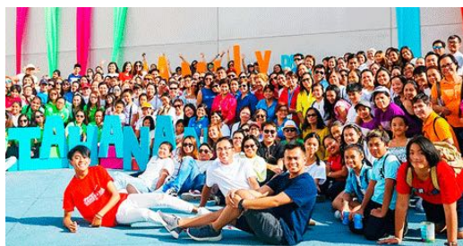
The Tahanan Filipino Ministry.