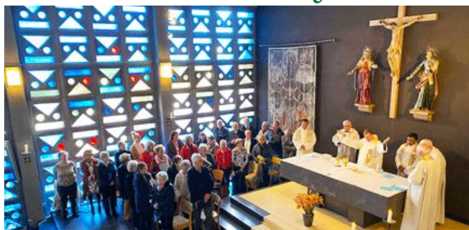
The solemn service of farewell.