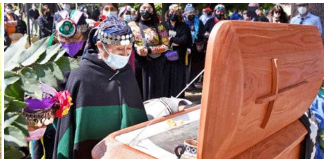
The funeral in the traditional Mapuche ceremony.