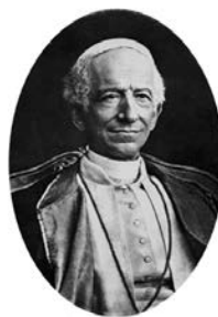
Pope Leo XIII