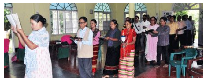
The participants of the Bible seminar.

On November 4, 2021, Kumarghat Deanery organized SCC (Small Christian Community) gathering in St. Raphael Parish Kamaranga Parish. Out of the eight parishes, there were representatives from 6 parishes and the priests and nuns. Around 48 people assembled in the parish Church. Around the Bible, they