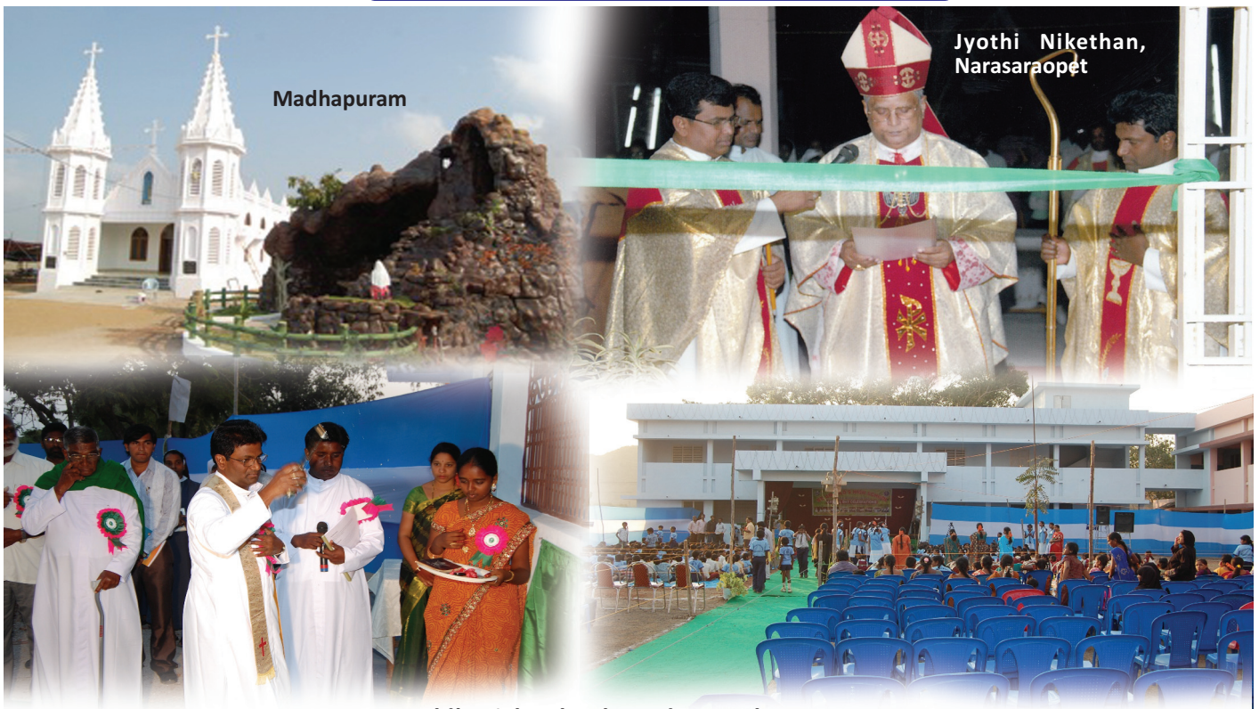
St. Arnold's High School, Medarametla